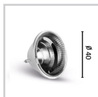
28-3868-51 Professional optic device 45°