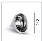
28-3868-51 Professional optic device 45°