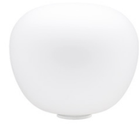
Table lamp with diffuser in satin-finish white blown glass. Supporting structure made of metal or polyester reinforced with glass fibre, painted white.