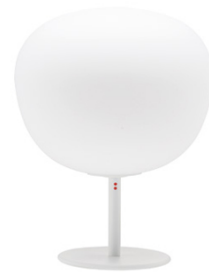
Table lamp with diffuser in satin-finish white blown glass. Supporting structure made of metal or polyester reinforced with glass fibre, painted white.